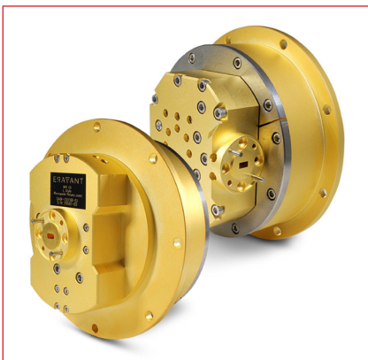
▲ Fig. 1 Rotary joint.

The signal divider/combiner in the mode converter is similar to discrete waveguide