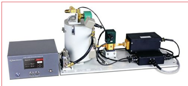
▲ Fig. 2 Noise calibration system with reference termination immersed in liquid nitrogen.