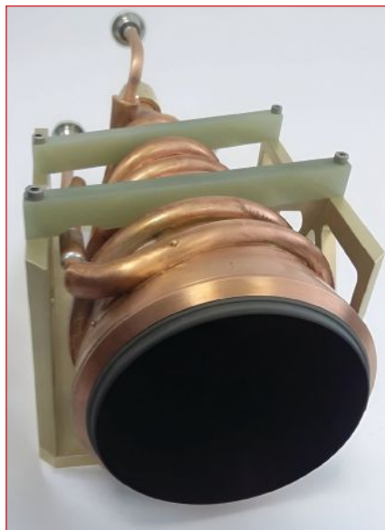
▲ Fig. 3 Thermal noise source with conical mmWave absorber.