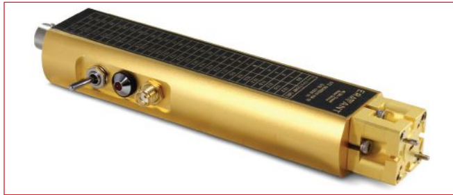
▲ Fig. 1 Eravant noise source.

Cold thermal sources are also constructed from absorbing materials that are cooled with precision temperature controllers. 9 The thermal noise radiated by such structures is typically coupled to a receiver through an antenna with both units operating in a condensation-free environment. Figure 3 shows a thermal noise source with a conical mmWave absorber. The temperature of the absorber is controlled with a circulating fluid.