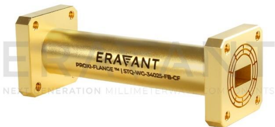
STQ Contactless Flange Front View