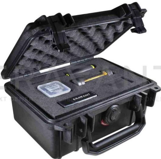
STQ Case Inside View