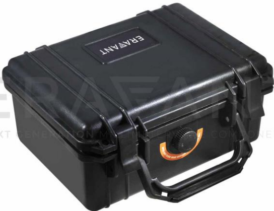
STQ Case Outside View