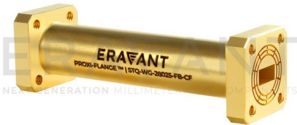
STQ Contactless Flange Front View