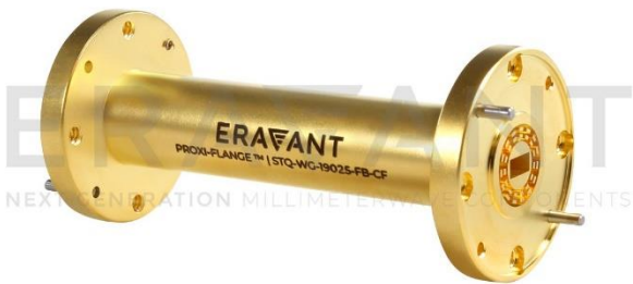
STQ Contactless Flange Front View