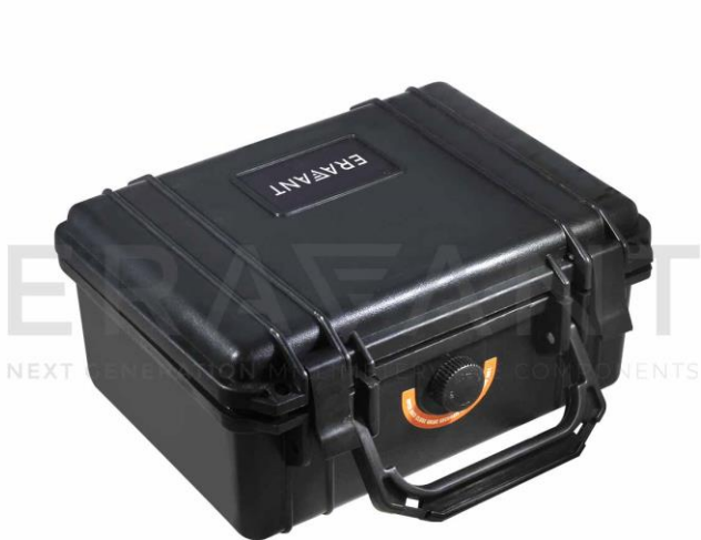
STQ Case Outside View