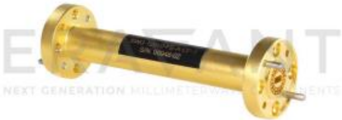
STQ Contactless Flange Front View