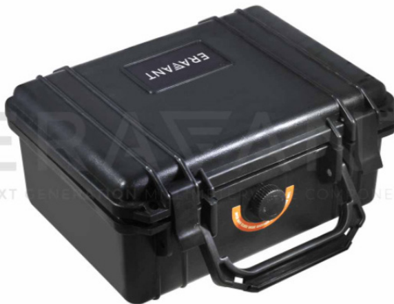
STQ Case Outside View