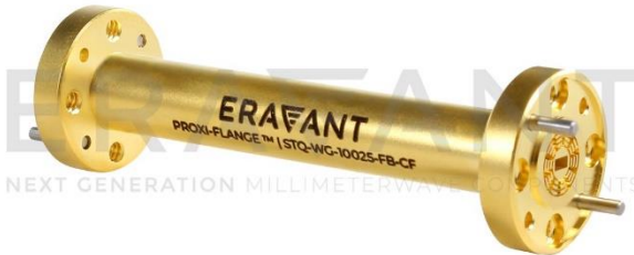
STQ Contactless Flange Front View