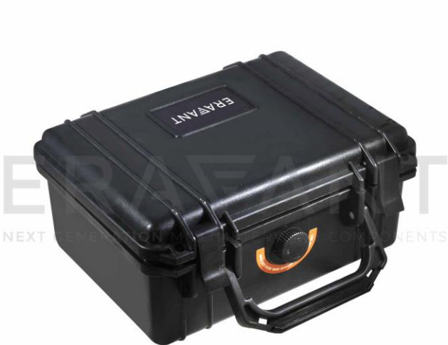
STQ Case Outside View