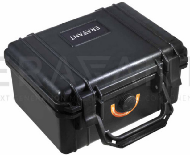
STQ Case Outside View