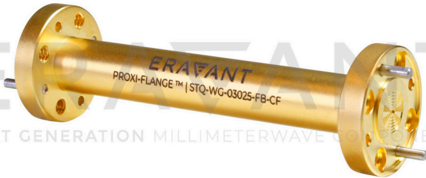
STQ Contactless Flange Front View