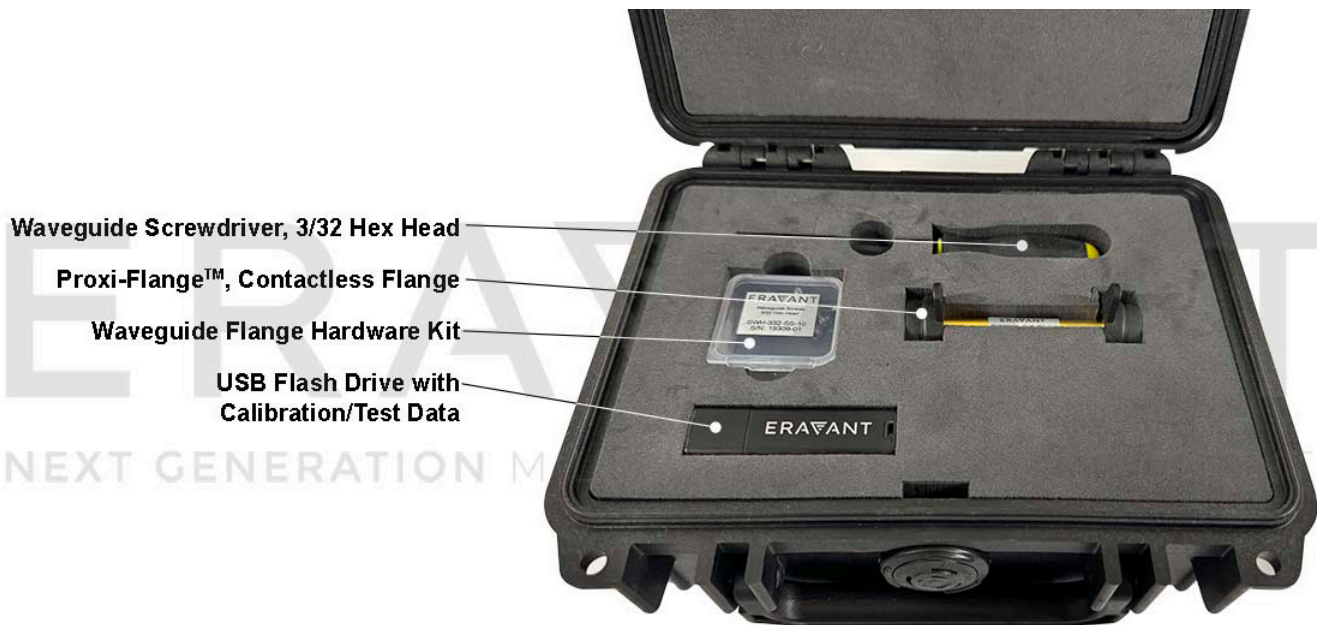
STQ Case Inside View