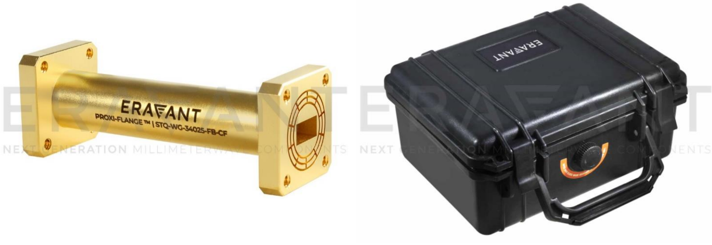
STQ Contactless Flange Front View