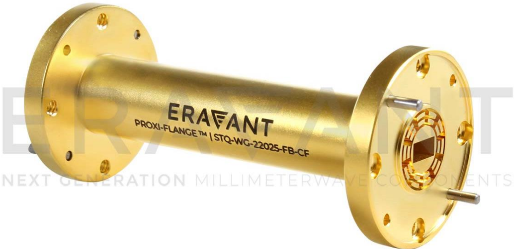
STQ Contactless Flange Front View