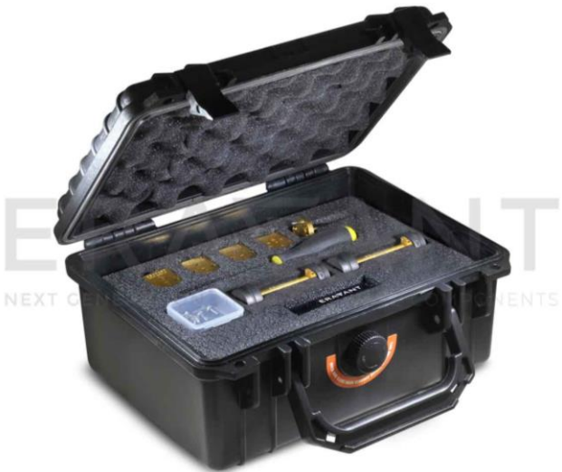
STQ Case Inside View