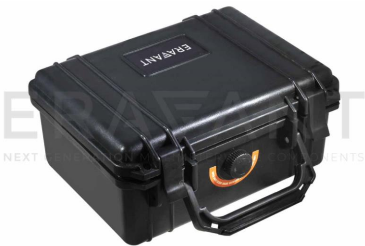
STQ Case Outside View