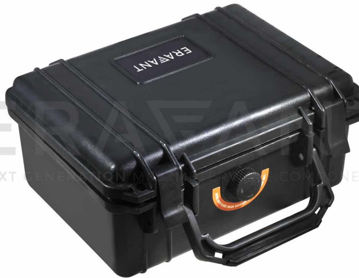
STQ Case Outside View