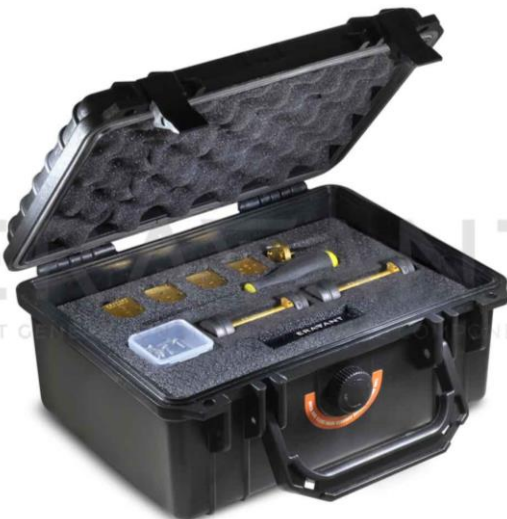
STQ Case Inside View