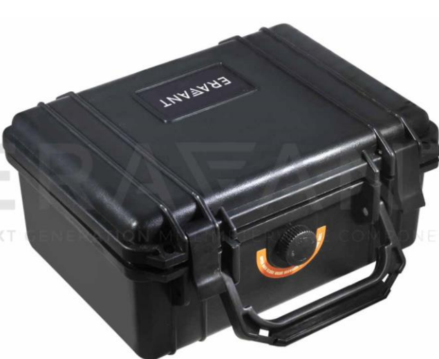
STQ Case Outside View