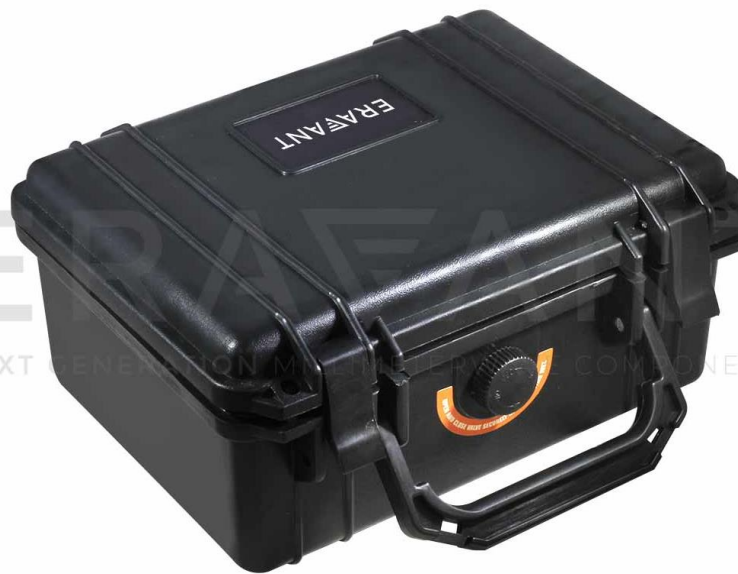
STQ Case Outside View