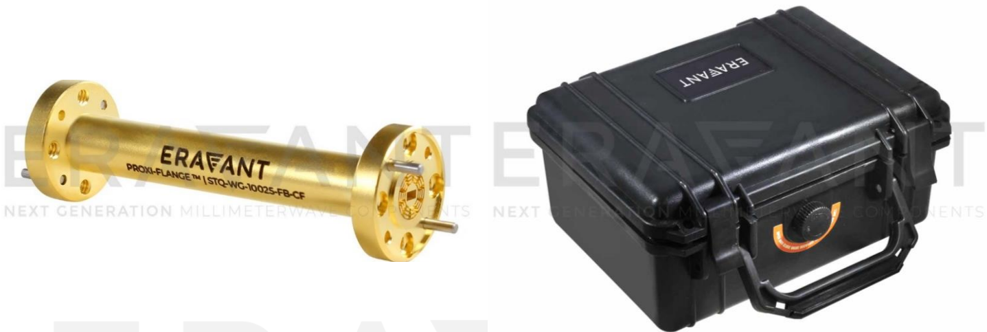
STQ Contactless Flange Front View