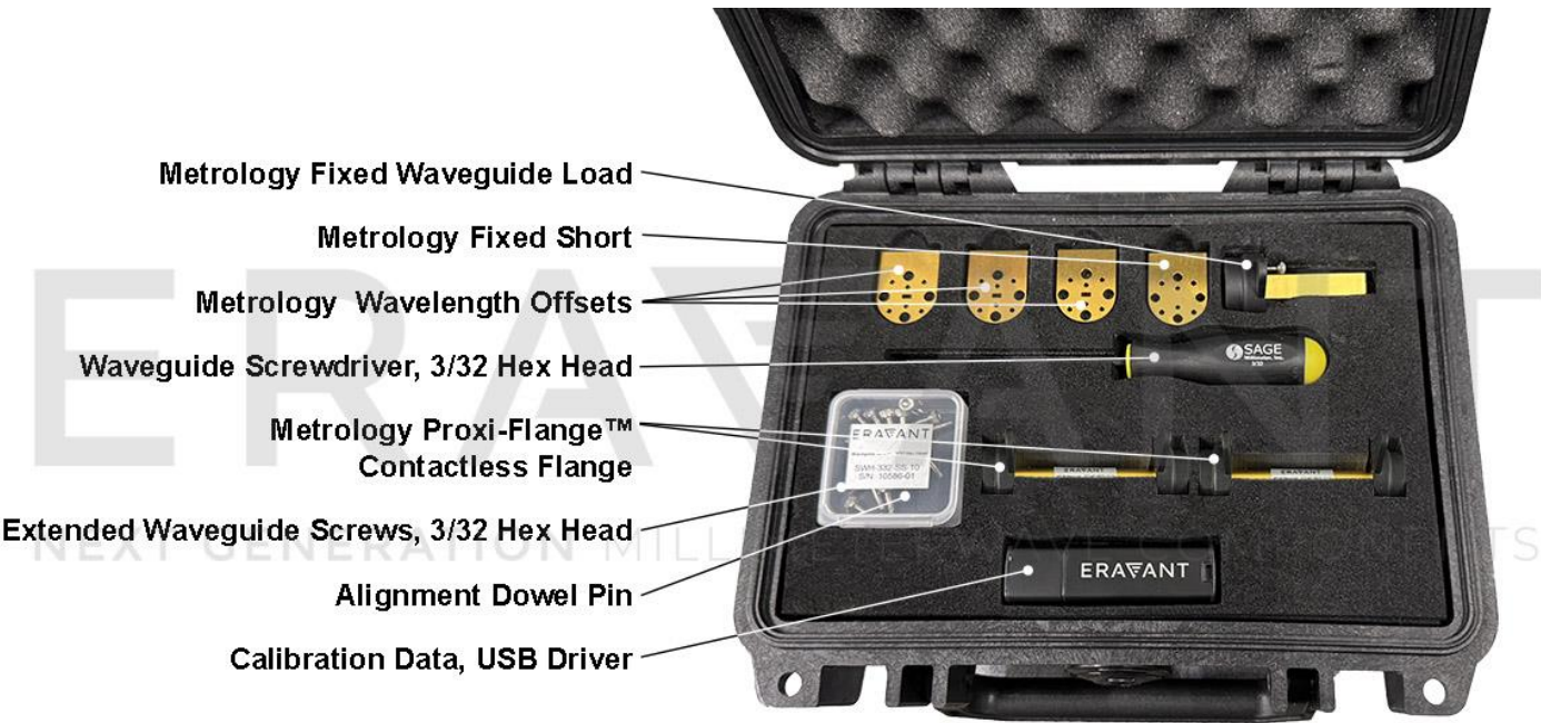
STQ Case Inside View.