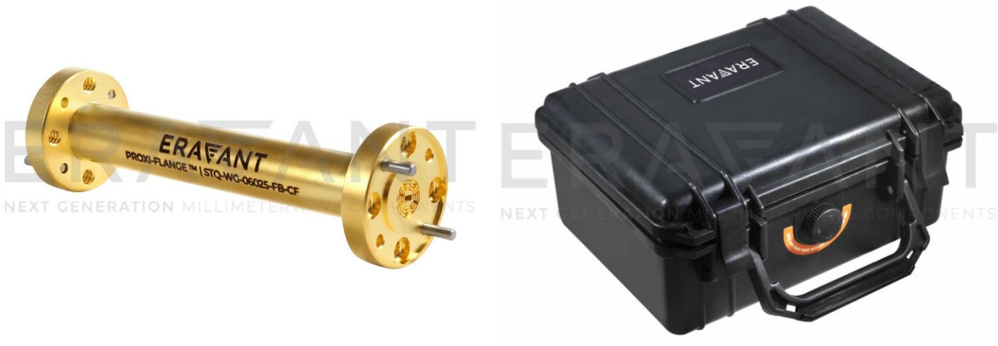
STQ Contactless Flange Front View