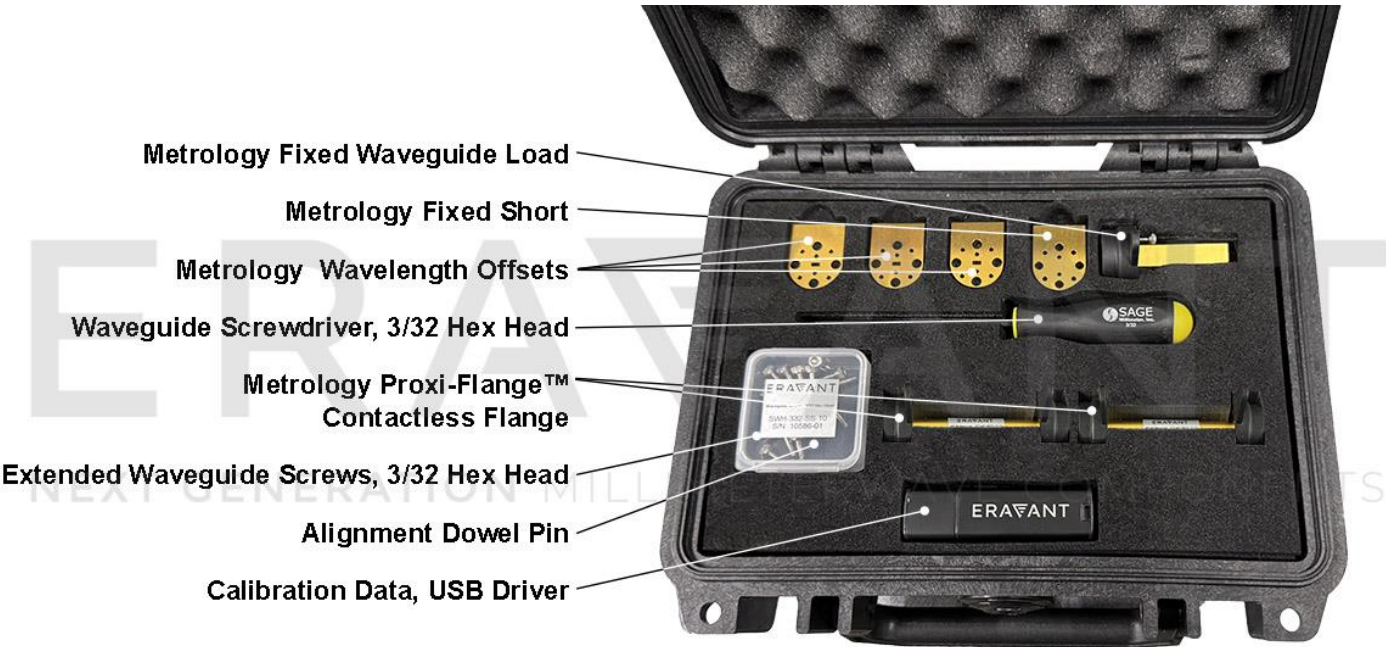
STQ Case Inside View