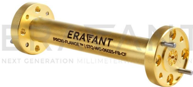
STQ Contactless Flange Front View