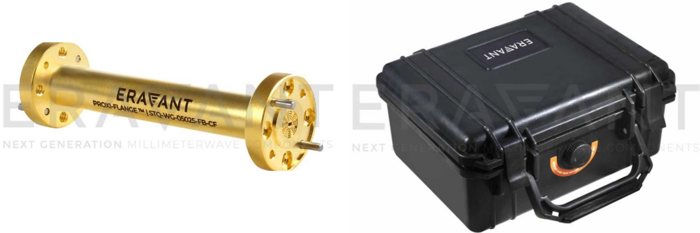
STQ Contactless Flange Front View