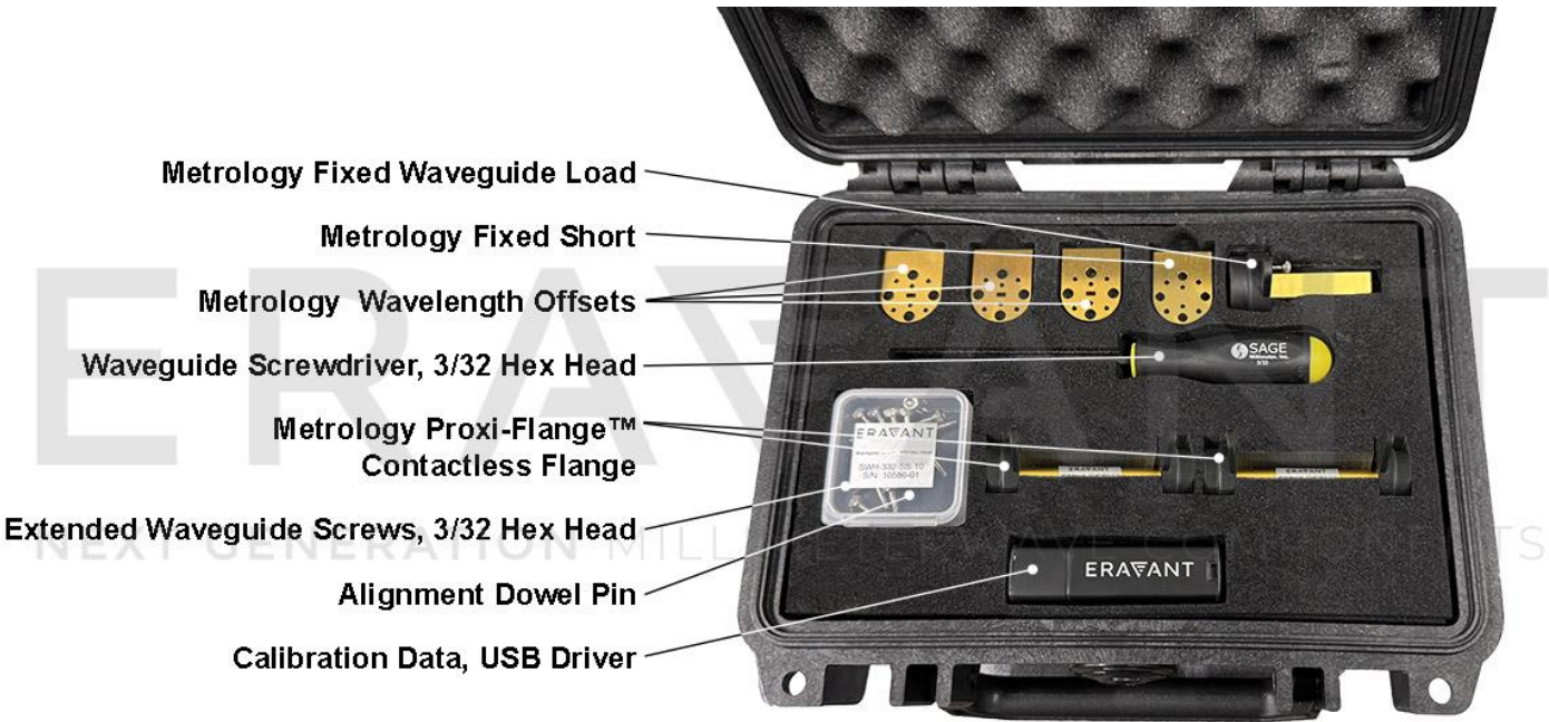
STQ Case Inside View