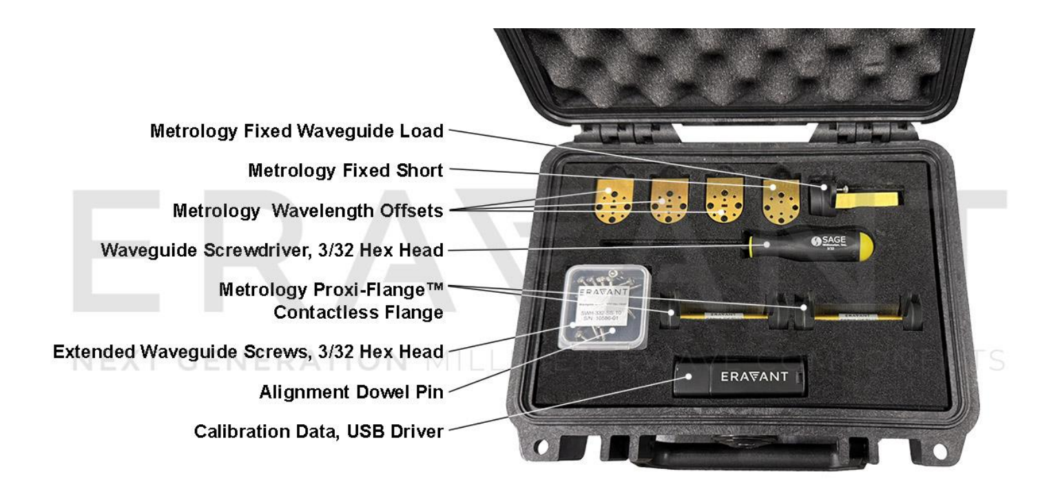
STQ Case Inside View