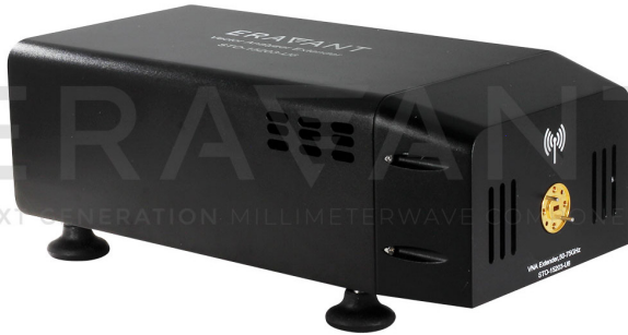
STO Front View