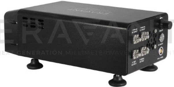
STO Back View