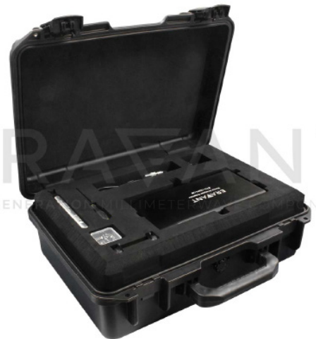
STO Inside View