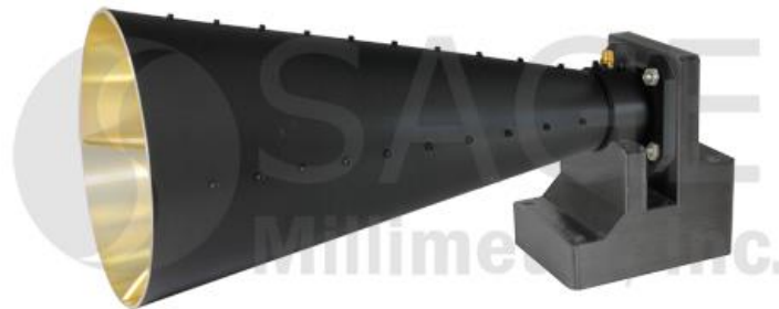
Antenna Not Included