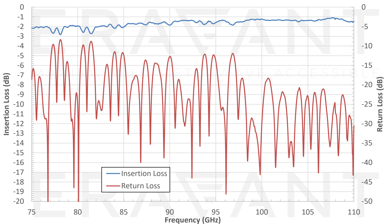
Typical Measured Insertion Loss and Return Loss vs. Frequency